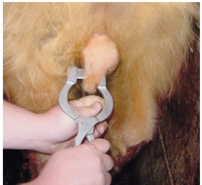
Figure 2. Newberry knife.