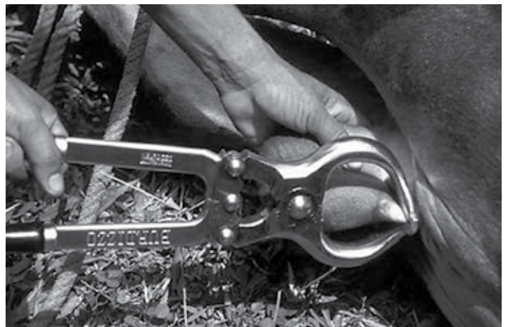
Figure 4. Emasculatome.

Castration should be a standard practice for all beef producers. Several techniques for castration are available; however, surgical castration using the Newberry knife is preferable. For additional information on castration, contact your local Extension agent.